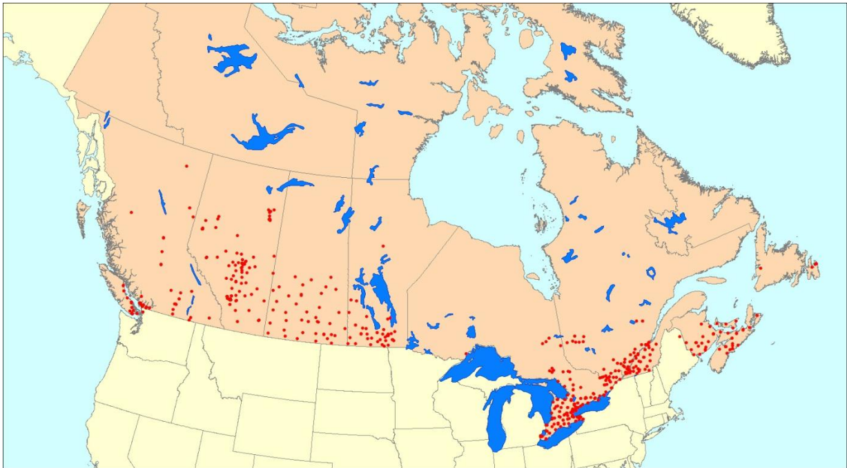
Current extent of private real time networks in Canada