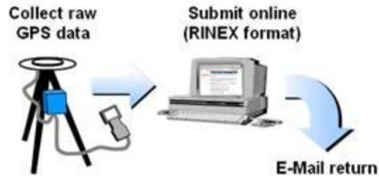
Figure 2-2 CSRS-PPP Overview.