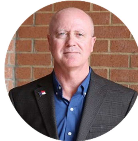
NCDOT UAS Operations Manager