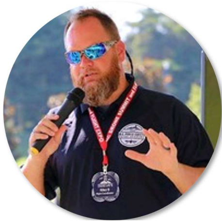
NCDOT UAS Program Manager